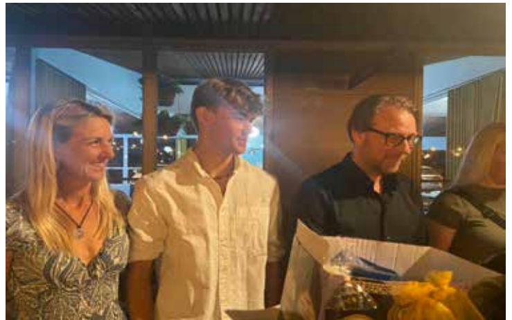
Initiations were held outside because we had so many new members to add :)