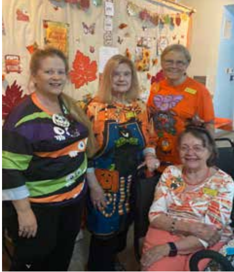
Our dinner hosts