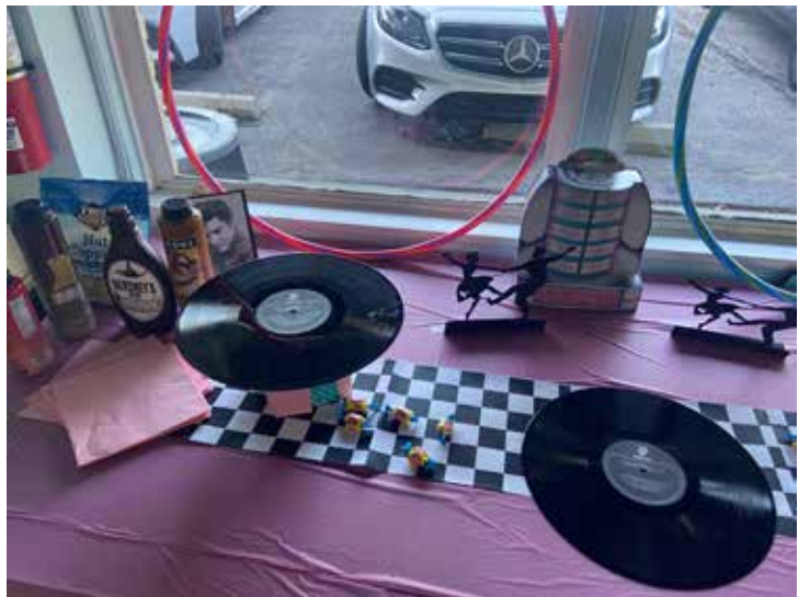
The decorations were everywhere! They were so creative and well done!