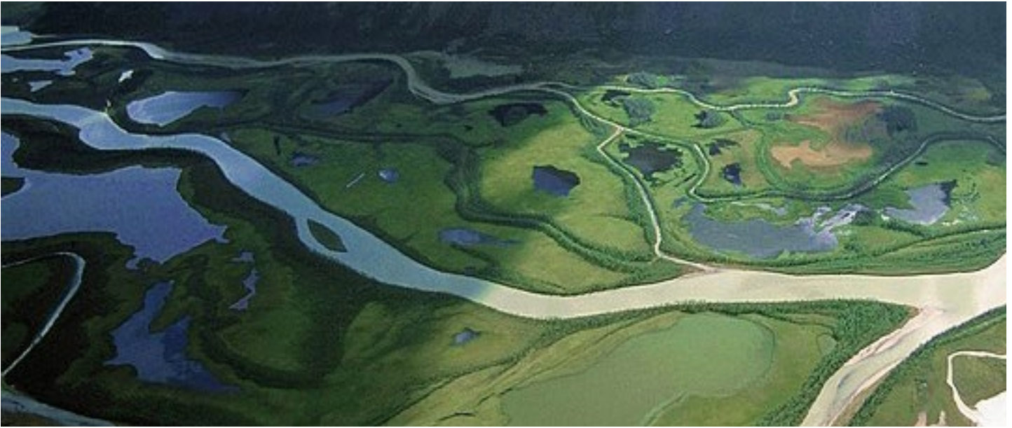
The delta of Rapadalen, Lapland (Sweden), Sareks Nationalpark. View from Skierffe

A World Heritage Site is a landmark or area with legal protection by an international convention administered by the UNESCO. World Heritage Sites are designated by UNESCO for having cultural, historical, scientific or other forms of significance. The sites are judged to contain “cultural and natural heritage around the world considered to be of outstanding value to humanity”.