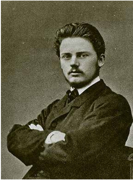
Gustaf de Laval

in technology and engineering was born early, and he was already building his first steam engines at age ten.