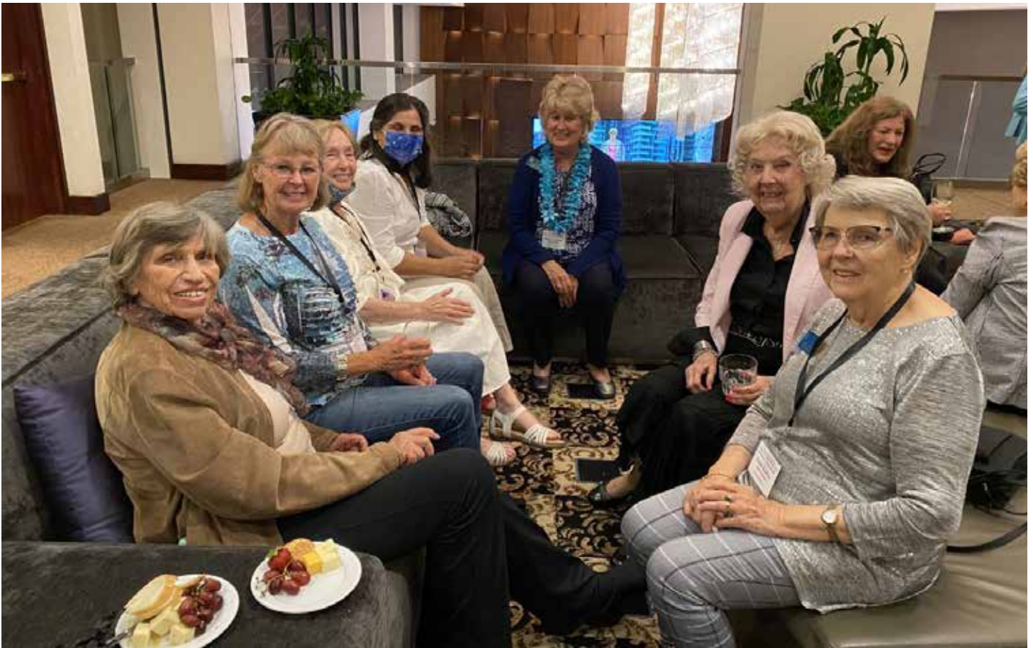
Friday Night Social