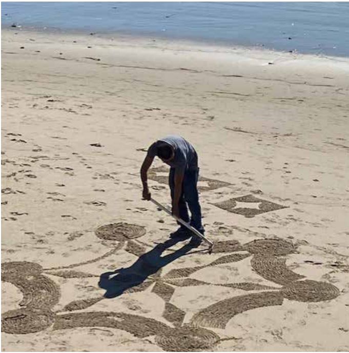
Sunset view from the hotel