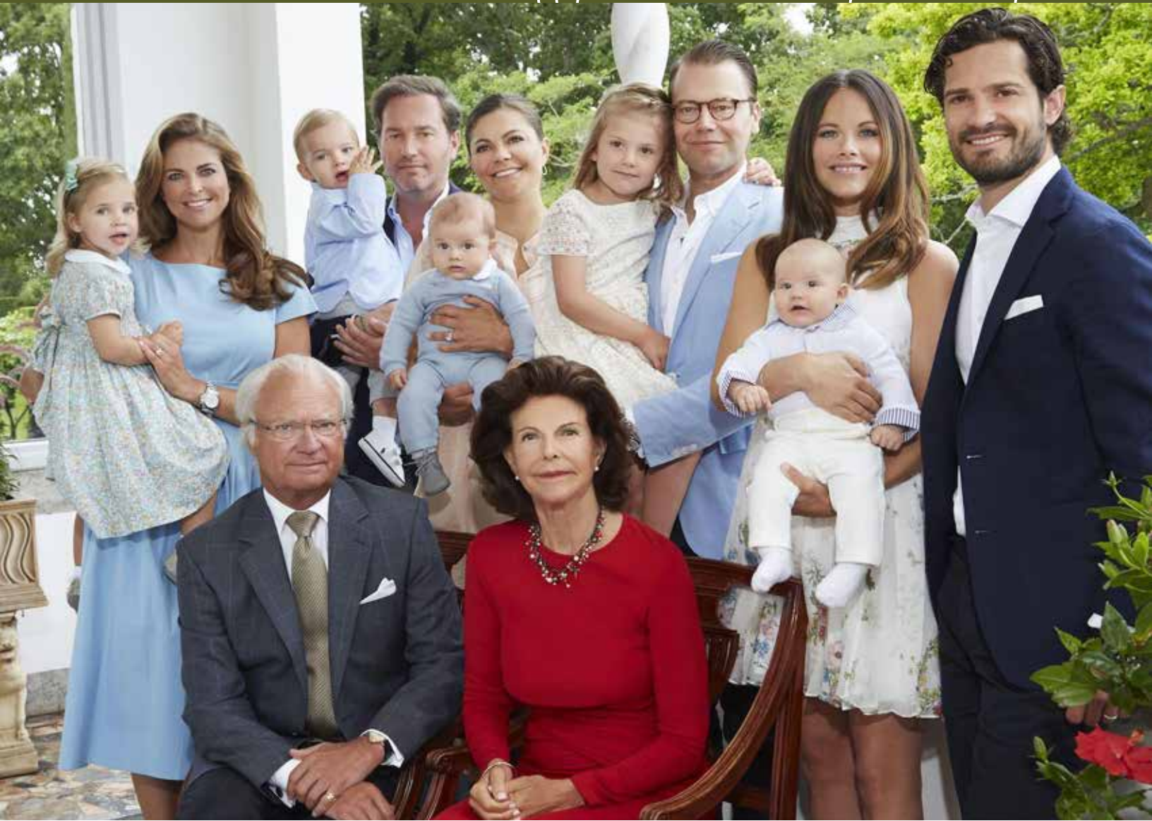
Royal family portrait from the summer palace Solliden, taken in the summer of 2016. Since then the family has grown even bigger.

Queen Silvia of Sweden (born Silvia Renate Sommerlath on 23 December 1943) is the spouse of King Carl XVI Gustaf they have three children: Crown Princess Victoria (heir apparent to the throne), Prince Carl Philip, and Princess Madeleine. In 2011, Silvia became the longest-serving queen of Sweden, a record previously held by Sophia of Nassau.