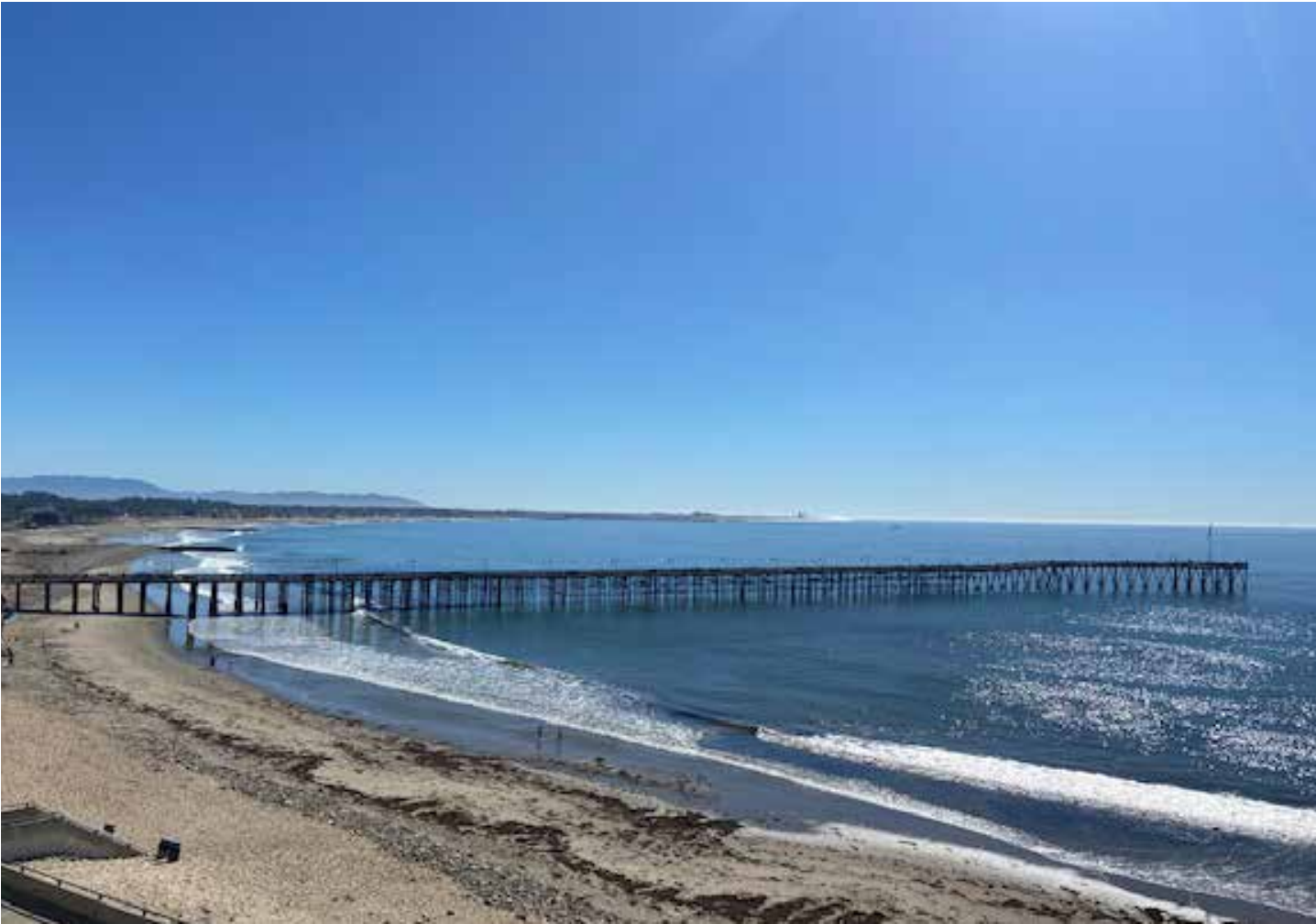
Views from the hotel were stunning!