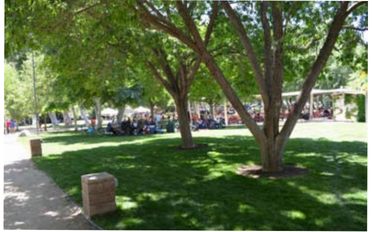
View of the park