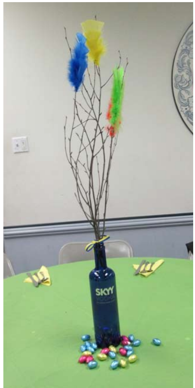
Traditional Easter decoration with feathers & birch branches. Our table decorations came all the way from Sweden.