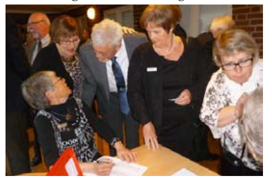
No 613 and 634 Members