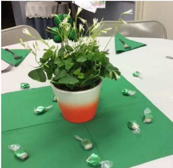
St. Patrick's Centerpieces