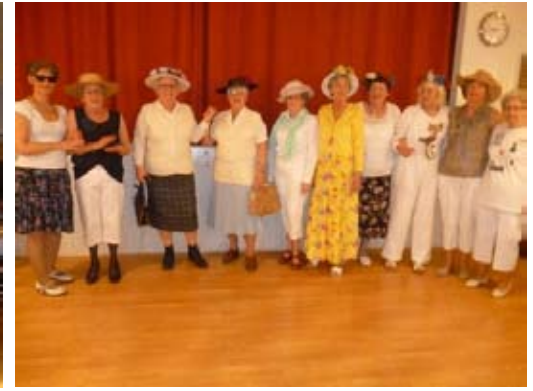
All the performing sisters in summer clothes.