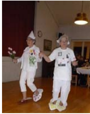
Two sisters with tulips from Amsterdam