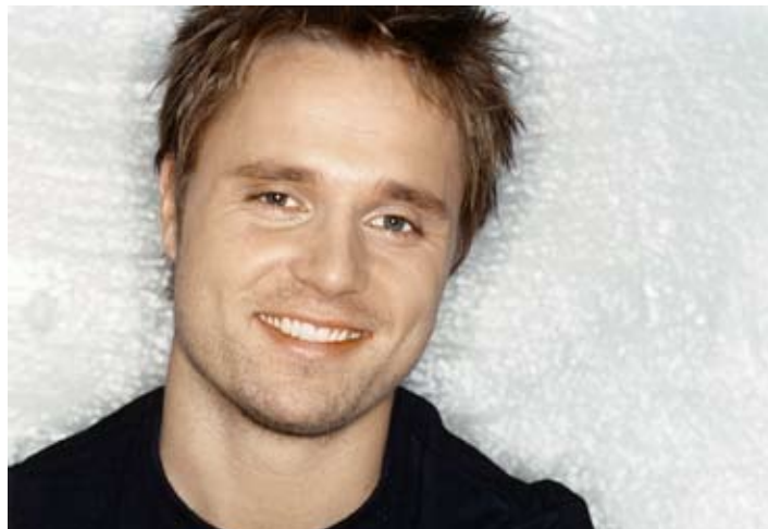
Max Martin

The track ended up winning the Top-Selling Country Single of the Year at the Billboard Awards and also hit No. 1 on the U.S. Billboard Hot 100.