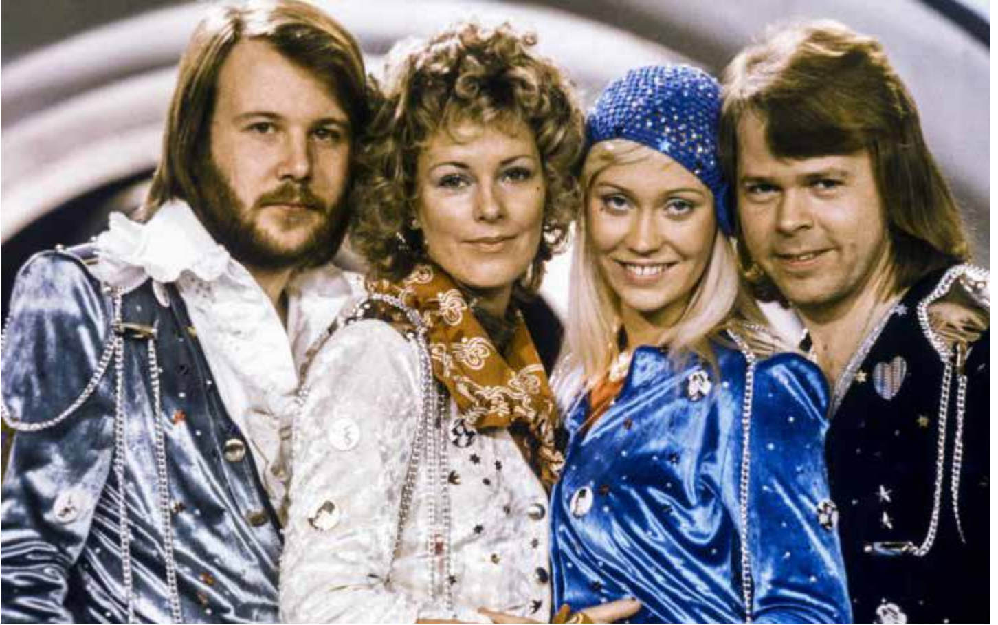
Story by MICHELE DEBCZAK/Mashable